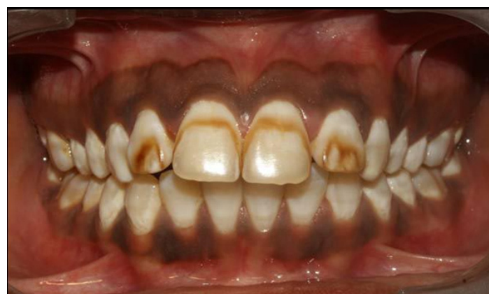
[Table/Fig-1]: Dean's fluorosis index of grade II and grade III [Table/Fig-2]: Universal Instron testing machine [Table/Fig-3]: Adhesive contrast using articulating paper

An 'Instron' universal testing machine AGS-10k NG (SHIMADZU) from Indian Institute of Chemical Technology, Hyderabad A.P, was used to measure the shear bond strength. The acrylic blocks were secured in the lower cross head of Instron machine and a loop made of 0.8 mm stainless steel wire encircling the bracket attached to the upper cross head of Instron machine was used to apply a shear force while debonding. The cross head of Instron machine moved at the uniform speed of 1 mm per minute [Table/Fig-2].